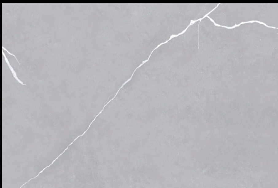
10183 - D