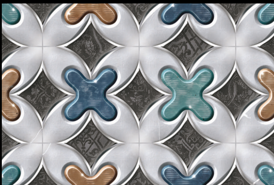
10183 - HL