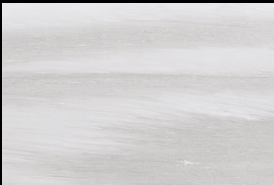
10181 - D