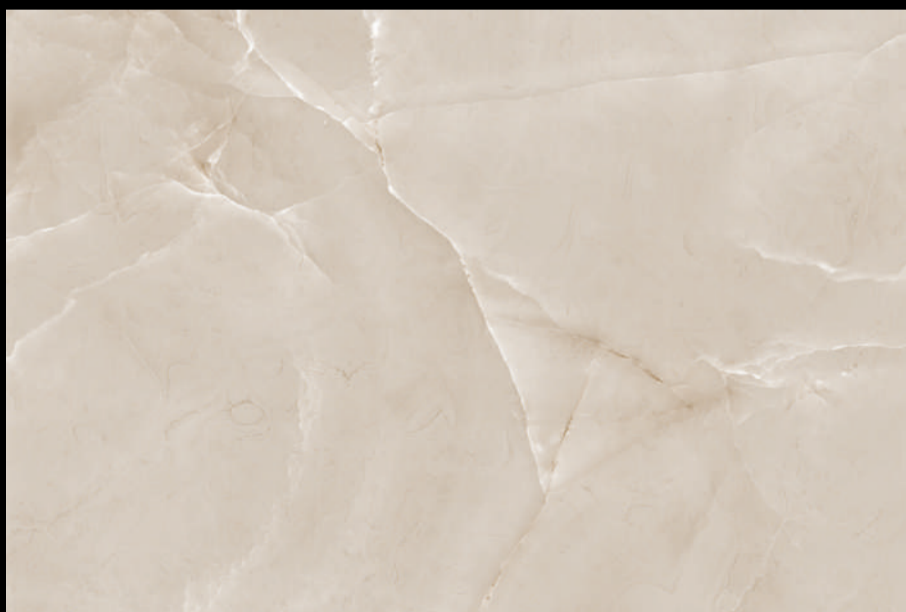
10185 - D