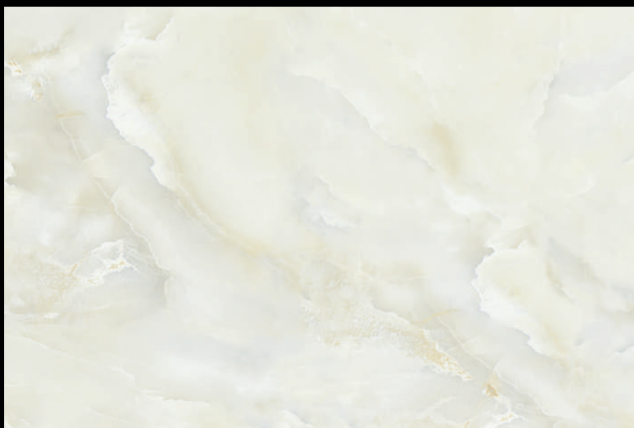
10184 - D