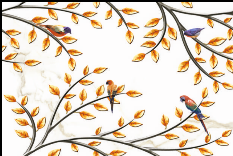
10182 - HL - 2