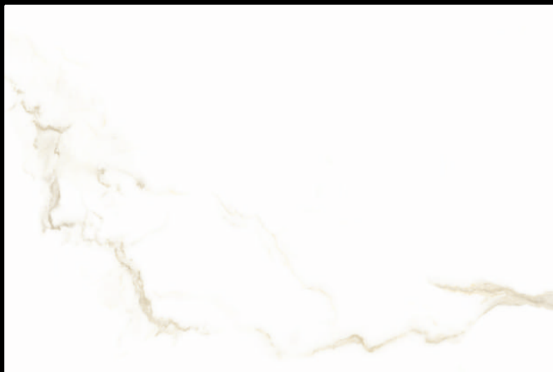
10182 - L