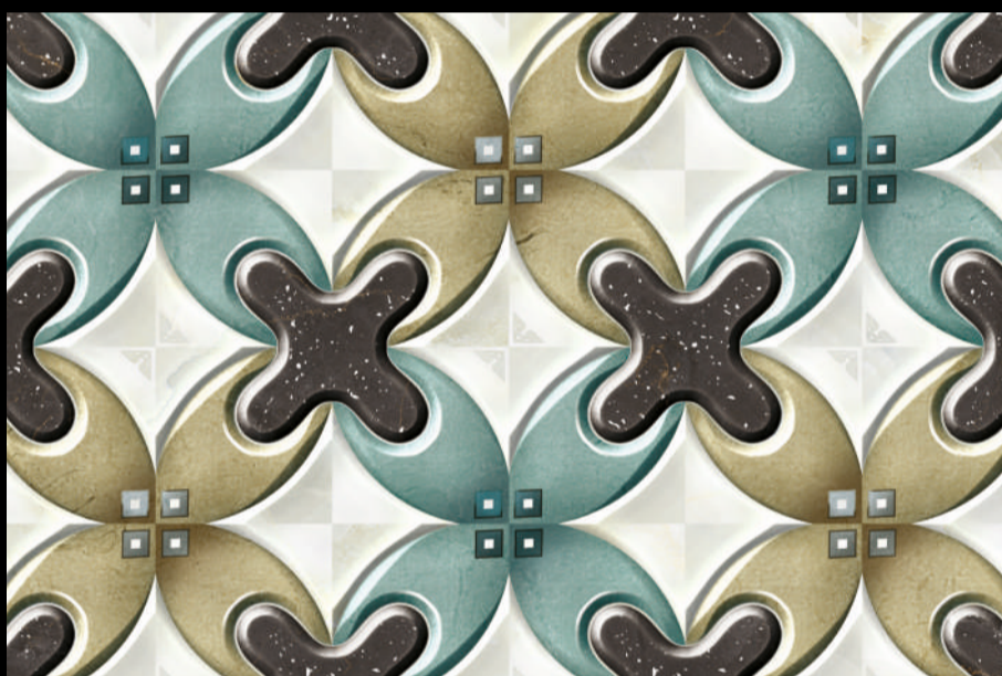
10184 - HL