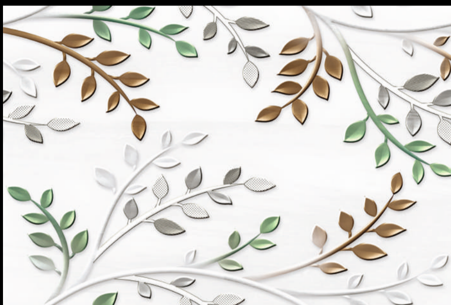
10181 - HL