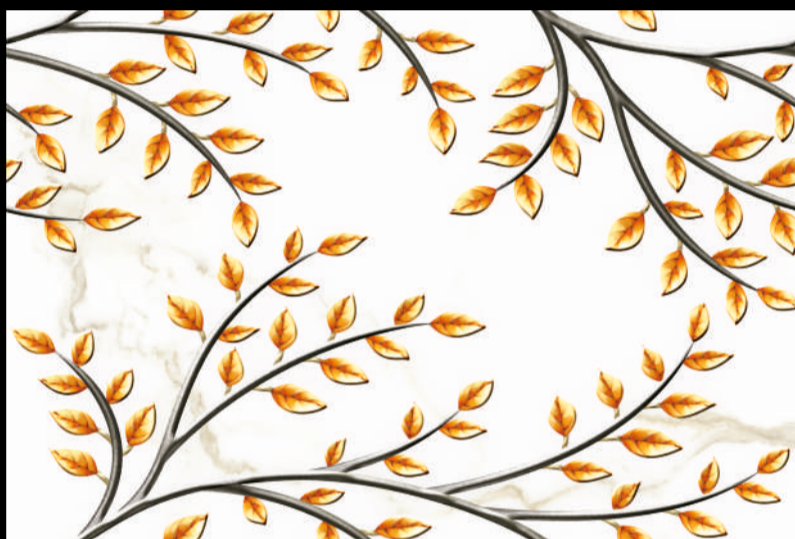
10182 - HL - 1